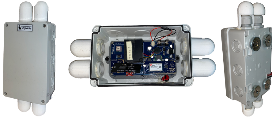
Fig. 1. AQ Sensors deployed in Trondheim.